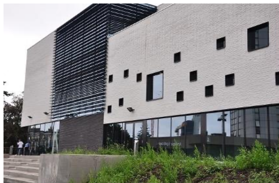
On the left: the S-building On the right: the K-building